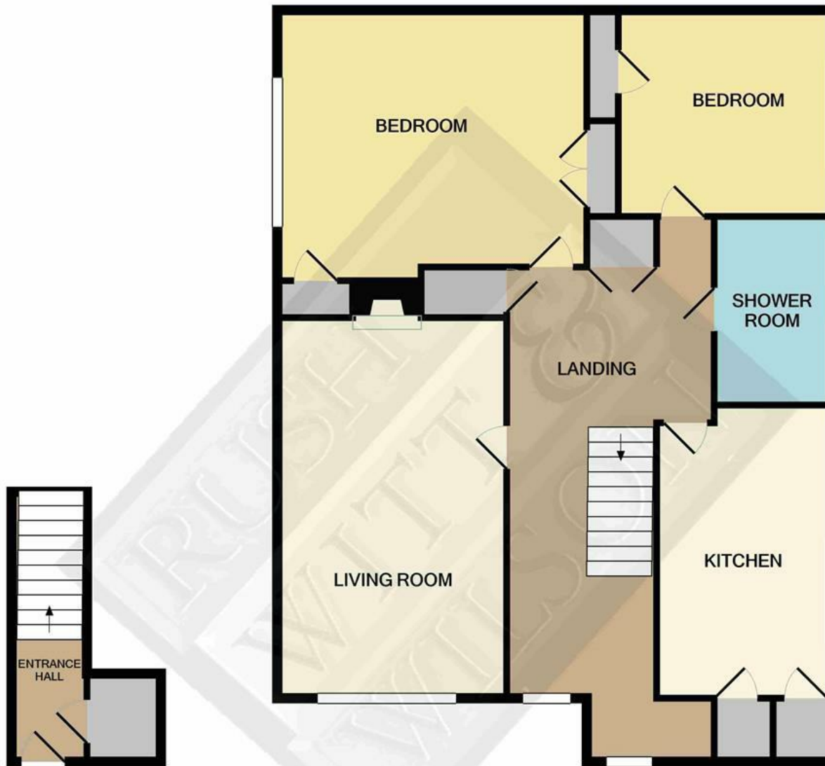
ENTRANCE FLOOR APPROX. FLOOR AREA 62 SQ.FT. (5.7 SQ.M.)